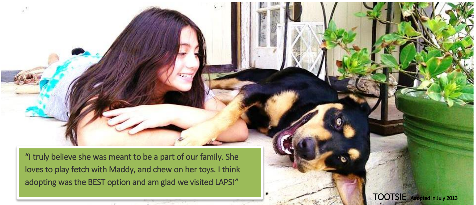
TOOTSIE Adopted in July 2013

"I truly believe she was meant to be a part of our family. She loves to play fetch with Maddy, and chew on her toys. I think adopting was the BEST option and am glad we visited LAPS!"